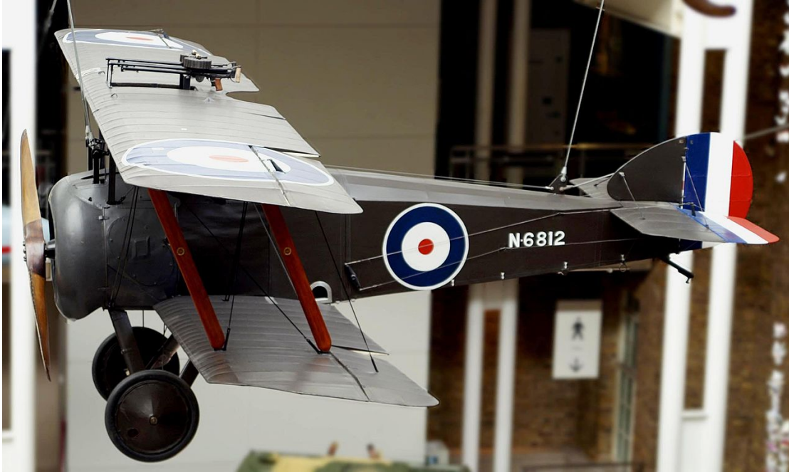
Sopwith Comic Camel at the Imperial War Museum, London (Imperial War Museum)

MANUFACTURER: Sopwith Aviation Company STANDARD ENGINE: 150hp Bentley BR1 rotary* MAX SPEED : 114 mph.