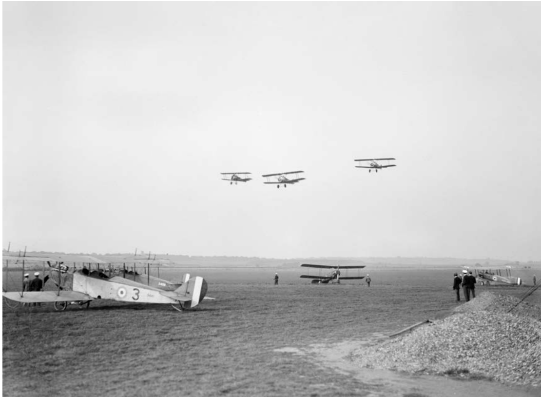
Three Sopwith F1 Camels flying over two Curtiss JN4s (left) and Avro 504Es (right) at Fairlop (The tower of Chigwell Church can be seen above the 3 of the nearer Curtiss.)

Just visible to the right is a guy rope of a Bessonneau Hangar protected by an embankment.