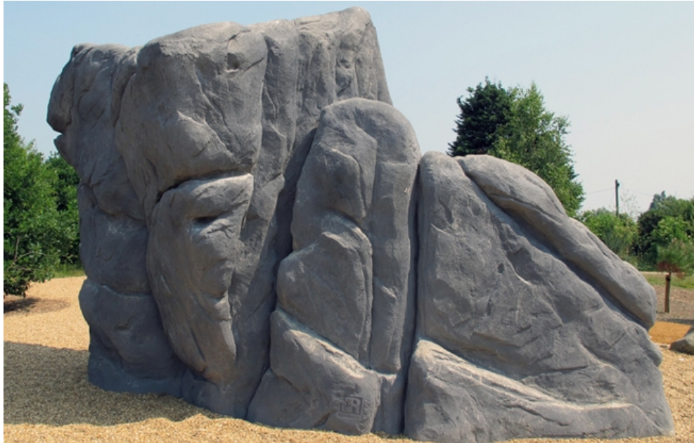
Fairlop Waters Boulder Park is the largest in the UK (Rockworks)

The project was conceived by LB Redbridge in 2009 and funded by the Mayor of London Priority Parks Programme, built by Rockworks and completed in 2010.