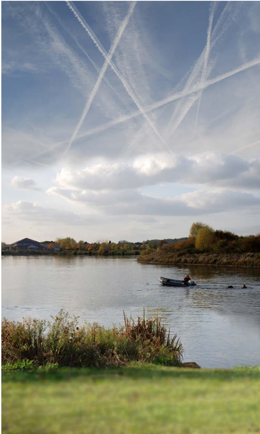
A peaceful Fairlop Waters Country Park