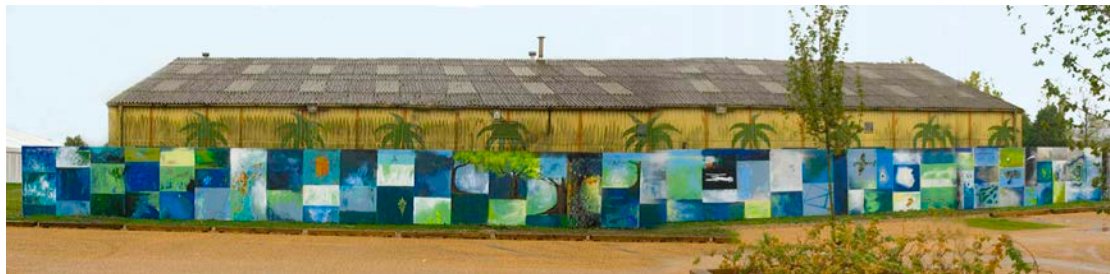
above: the completed Mural in 2010