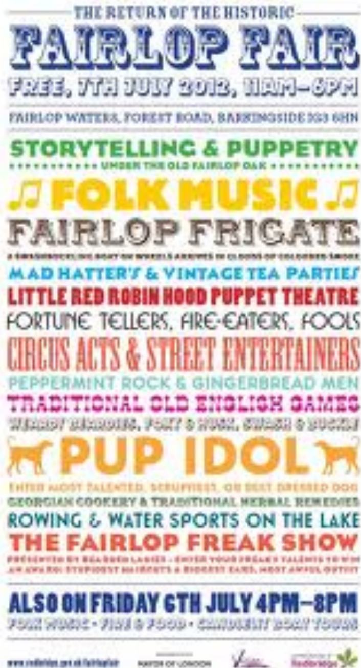
Poster for the return of the historic Fairlop Fair 2012