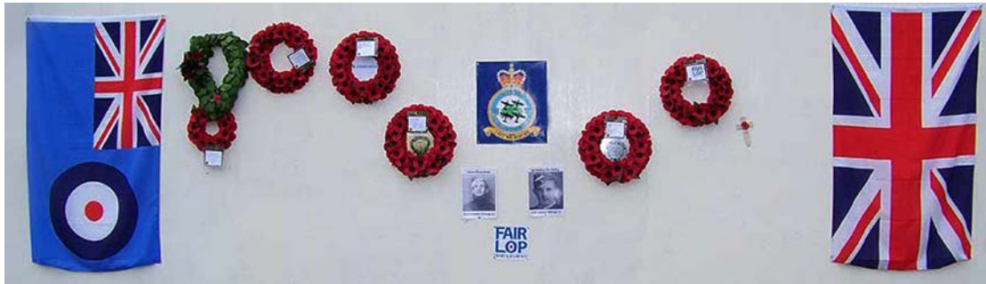
Fairlop Memorial Wall